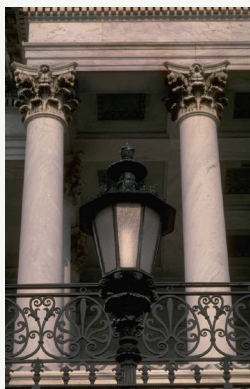
WHAT PHOTOGRAPH WILL YOU PUT HERE?